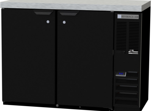
BB48HC-1-F-B-27 (Black model shown)