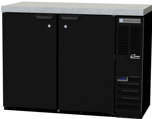
BB48HC-1-F-B-27 (Black model shown)

3 Year Parts/Labor Warranty Additional 4 Year Compressor Warranty