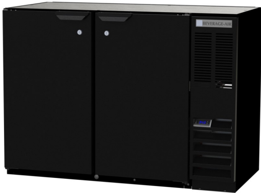
BB48HC-1-F-B (Black model shown)