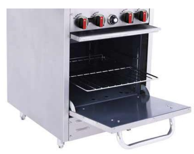
Removable Crumb Tray & Oven Door (Model BAS24O Displayed)

The BakeMax America BAS36-24-2 – 6 Burner Gas Range w/ 24" Manual Griddle is designed to provide the ultimate in performance and durability. Allowing you to roast and cook a wide range of meals, with efficiency, convenience at an affordable price.