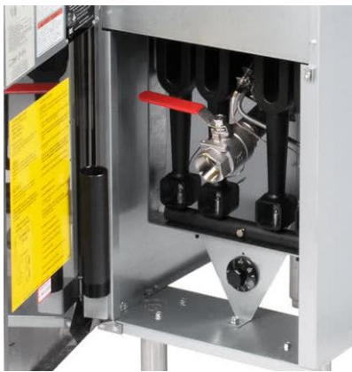
Inside View of Drain & Thermostat

** Due to continuous product improvement, specifications are subject to change without notice.