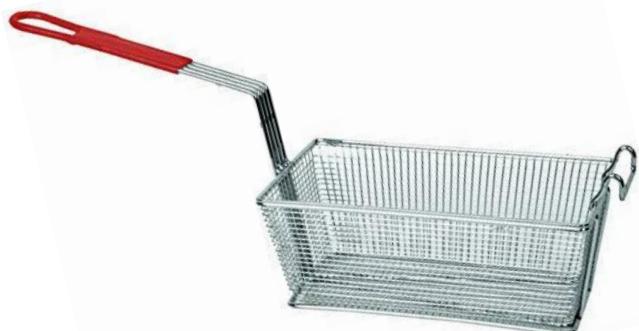
Fryer Baskets Included