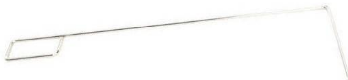
Drain Rod Included