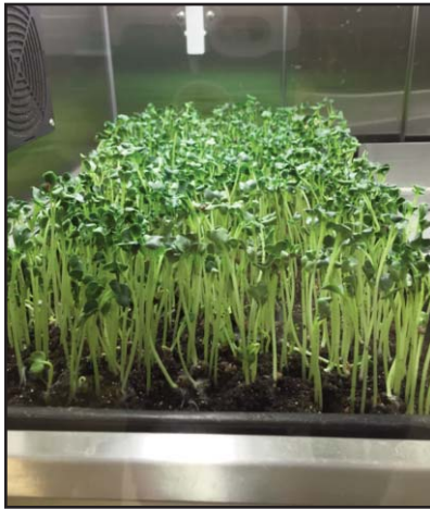
Daikon Radish Sprouts 4 days old

Since 1947, Foodservice Equipment That Delivers!