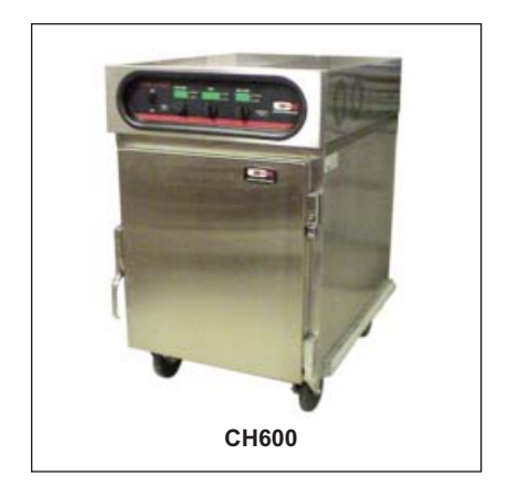
MEAT PROBE INCLUDED!

EASY-TO-USE DIGITAL CONTROLS... Control cooking and holding with separate dial controls and digital display. Cook according to time or according to product temperature with meat probe. Temperature range of 100°F to 200°F for hold cycle and 100°F to 325°F for cook cycle. Eighteen hour timer counts down in cook cycle. When cook cycle is over, cabinet automatically switches to hold cycle and timer counts up.