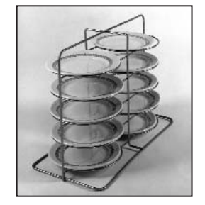
"P" carrier for open plates

OPTIONAL PLATE CARRIERS... "P" or "C" carriers are available. "P" type holds 8-3/4" to 10-1/2" diameter open plates while "C" type holds up to 10-1/2" diameter covered plates. Specify type, if any, when ordering. Carriers will hold plates 4-high (8C or 8P) in carts with 13" shelf spacing and 5-high (10C or 10P) in carts with 16" shelf spacing. See table on front page for types and quantities that will fit in each cart.