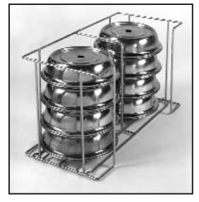
"C" carrier for covered plates

REMOVABLE WIRE SHELVES...Welded. duplex nickel-plated with reinforced shelf clips. Sturdy for heavy plate loads and removable for cleaning.