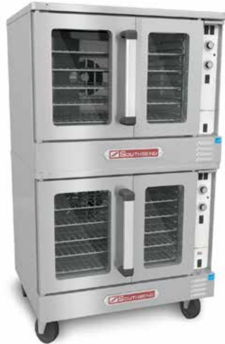
(KLGS/27SC shown with optional casters)