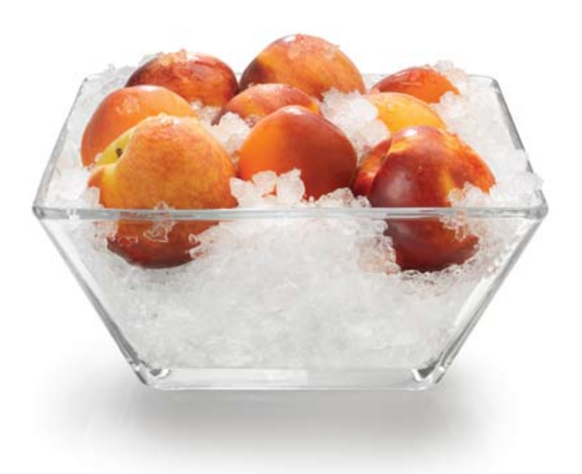
New Flake and Pearl Ice® Machines