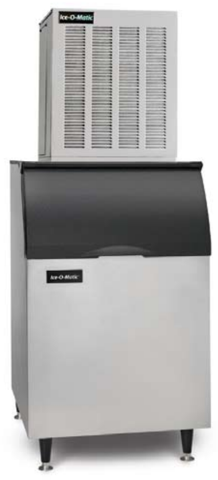
MFI 500 on B55 BIN

Available in a variety of ice-production capabilities, both the MFI Modular Flake and GEM Modular Pearl Ice machines share these state-of-the-art features: