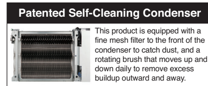
Patented Self-Cleaning Condenser

This product is equipped with a fine mesh filter to the front of the condenser to catch dust, and a rotating brush that moves up and down daily to remove excess buildup outward and away.