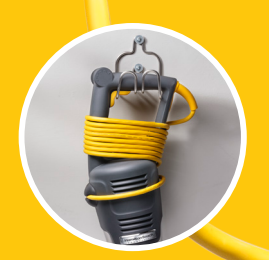
Wall Mount and Cord Holder