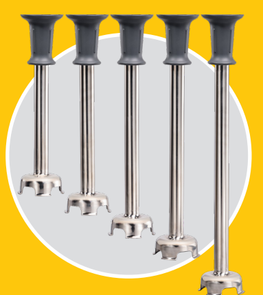
Interchangeable Shaft 12"/305mm, 14"/355mm, 16"/406mm, 18"/457mm, and 21"/533mm (sold separately)