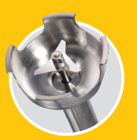
Stainless Steel Blade with Guard Blends, chops, purees, or emulsifies ingredients quickly

12"/305mm shaft - up to 6 gal. (23 L) 14"/355mm shaft - up to 14 gal. (53 L) 16"/406mm shaft - up to 23 gal. (87 L) 18"/457mm shaft - up to 32 gal. (121 L) 21"/533mm shaft - up to 42 gal. (158 L)