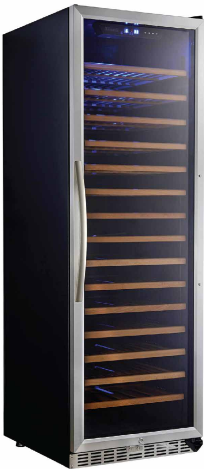
USF168S - Single Temperature

Product Warranty: 1 year on parts and labor and 3 years on the compressor.