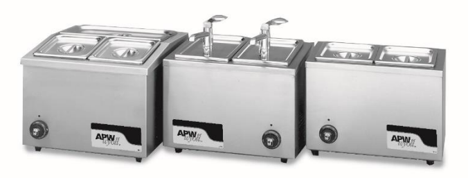
Pumps & lids by others