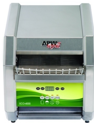
Model ECO 4000 350E

*Warranty does not include rock grates, cooking grates, burners shields or fireboxes.