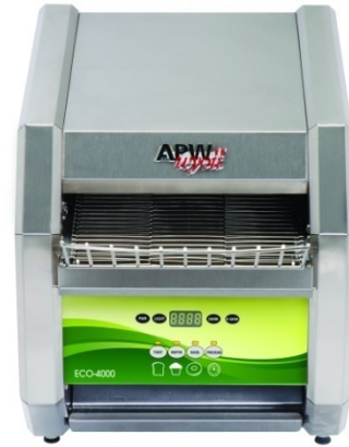
Model ECO 4000 350E

*Warranty does not include rock grates, cooking grates, burners shields or fireboxes.