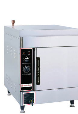
Altair II - 4

The door is insulated. Safety shut-offs are provided by a hidden magnetic door switch, low water/high limit heat switch, temperature probe, water sensing probe and water-fill timer.