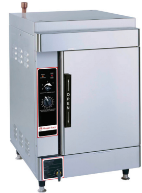
Altair II - 6