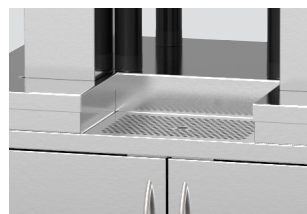
Cabinet Store - EasyFill

Especially designed retail cabinet. It is characterised by the "Easy Fill" space at the top, making it easier to fill large-capacity containers.