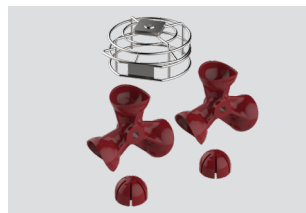
Specific squeezing kit

Juice extraction kits and blade that adapt to the pomegranate size and hardness. Exclusive feed system that avoids jamming. Juice extraction speed that adapts to the specific resistance of pomegranate.