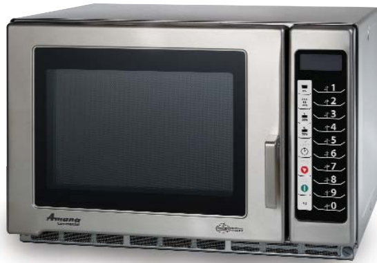
Model RFS18TS shown