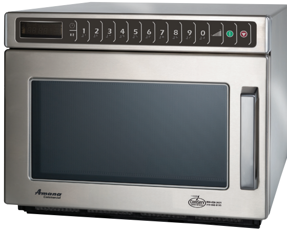
Model HDC212 shown