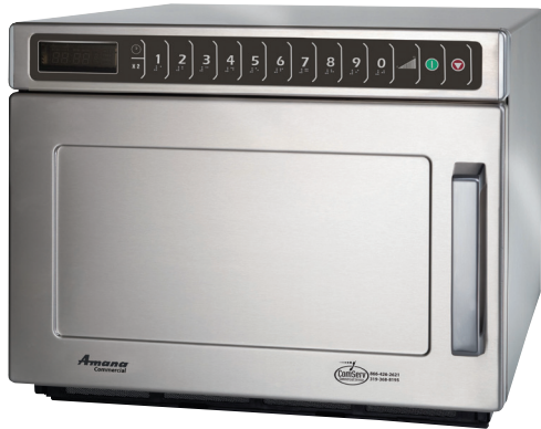
Model HDC18SD2 shown