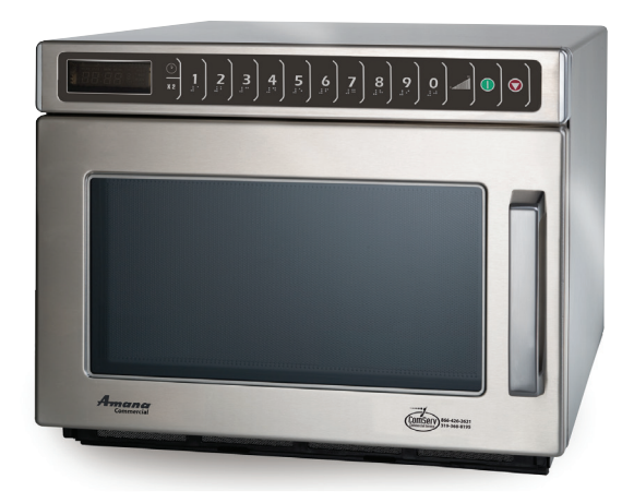
Model HDC182 shown