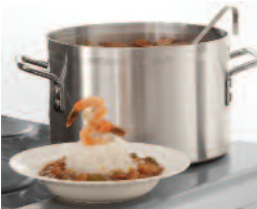
Large 5" (127 mm) stainless steel landing ledge for convenient plating.