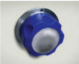
Durable cast aluminum with a Valox™ heat protection grip.