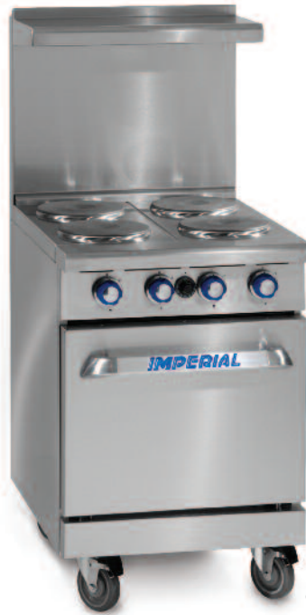
IR-4-E shown with optional casters