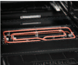
5.3 KW element provides even heating throughout the oven cavity.