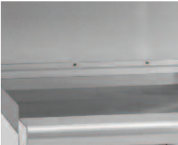
Thick steel polished griddle plate for even heating across the entire surface.