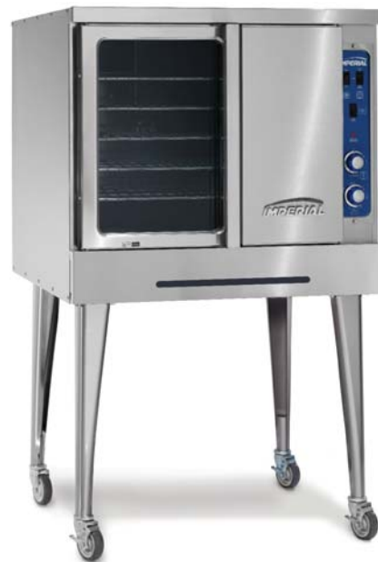
ICV-1 shown with optional casters

Four bearings per door extend the life of the door mechanism.