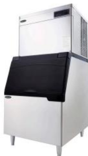
Bin KB-350 shown above is not included - sold separately