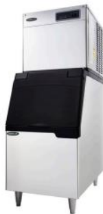
Bin KB-260-22 shown above is not included - sold separately