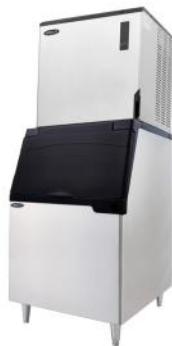
Bin KB-440 shown above is not included - sold separately