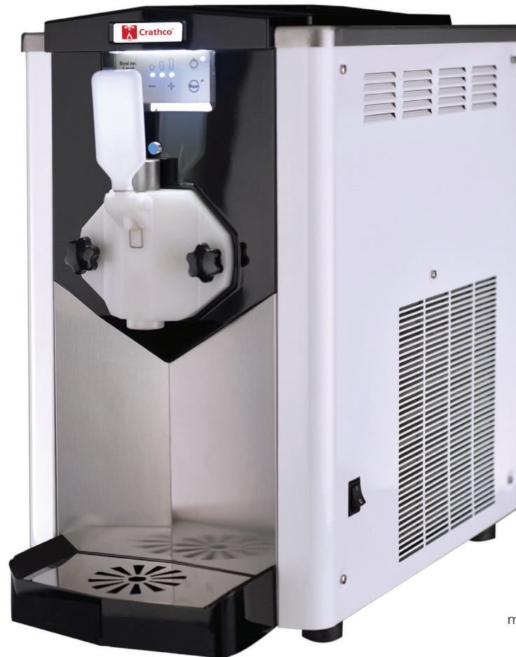
model Karma Gravity