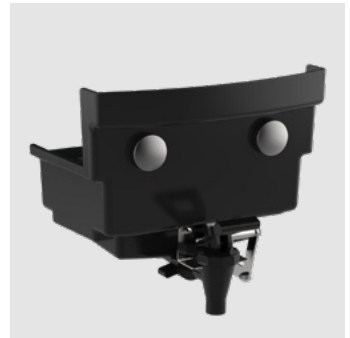
Injected Self Service Tray