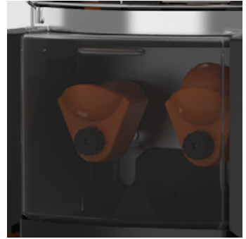
Smoky grey front cover